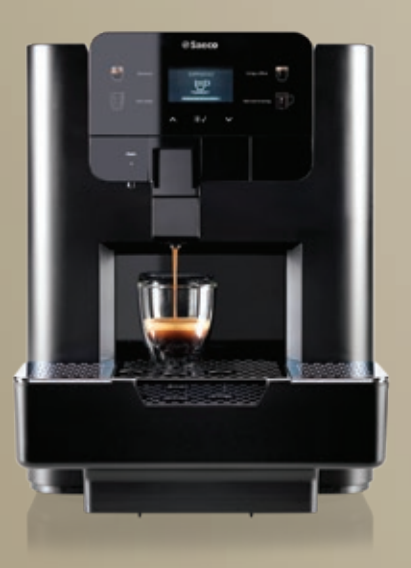
AREA Focus Lavazza Blue®*

Optional water supply connection (with the water supply kit)