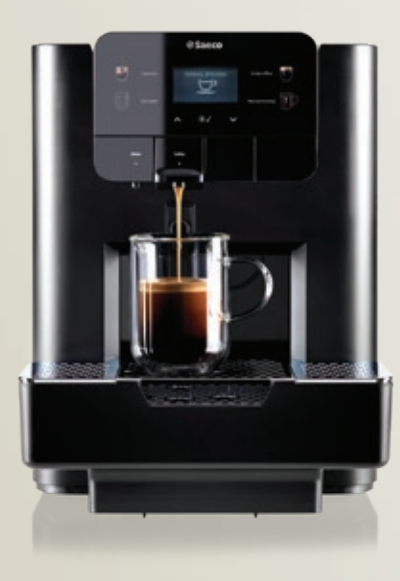
AREA Focus Nespresso®*

Optional water supply connection (with the water supply kit)