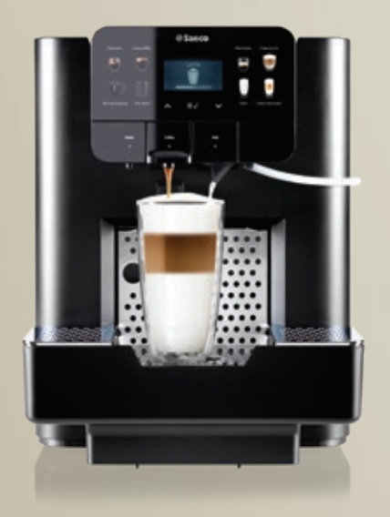
AREA OTC HSC Nespresso®*

Optional water supply connection (with the water supply kit)