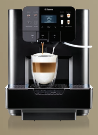
AREA OTC HSC Lavazza Blue®*