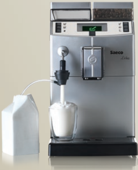
Lirika Tuono Cappuccinatore

Tuono cappuccinatore to be mounted on the steam wand for the frothing of creamy cappuccinos and milk drinks. It can be used also in combination with the Milk Cooler: