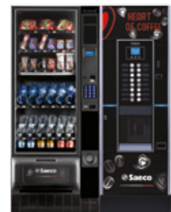
Artico S + Cristallo Evo 400